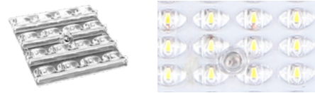
Anti-UV PC Lens Transparency up to 93.8%, 72+ type beam optional flexible for applications